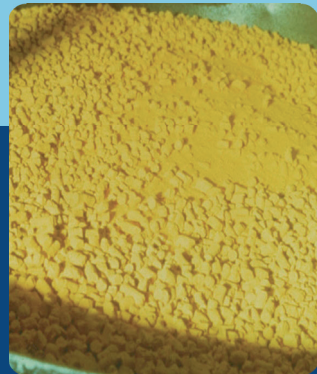
Uranium Ore Concentrate - "Yellowcake"